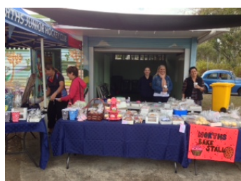
Some of our great helpers and lots of goodies!