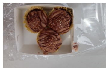
A very popular ferro rocher cupcake. Yum !

Fingers crossed we had some lucky winners in the raffle too !